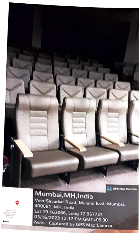
Radhabai Vaze Auditorium